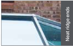
Neat ridge ends

Triple layer protection at the ridge end, with glazing compression trims, a weathering shield and a secure-fit cover